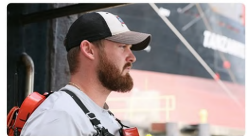
The American Waterways HERO Award: Honoring Industry's Heroic Mariners